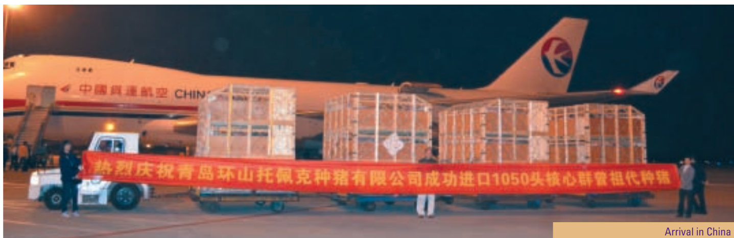
Arrival in China

September 18, 2011 was a day the TOPIGS Canada team may never forget! After months of preparation and attention to details, a Boeing 747 Jumbo jet lifted off from the Winnipeg airport taking 1,003 purebred TOPIGS breeding pigs to China.