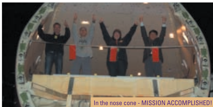
In the nose cone - MISSION ACCOMPLISHED!