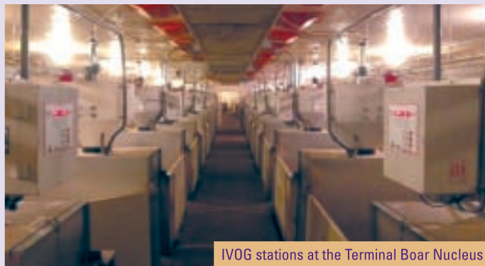
IVOG stations at the Terminal Boar Nucleus

Never before has on-farm efficiency been more important than now. With feed being the major cost in getting a pig to market, the current high cost of feed causes us to focus on growth and feed efficiency. However, one must consider all areas of production to gain the "Full-Efficient" effect and benefit.