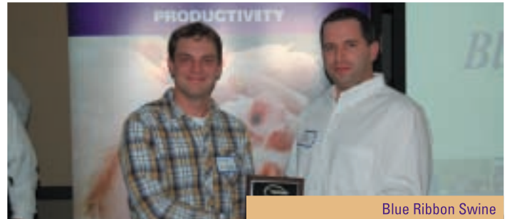
Blue Ribbon Swine