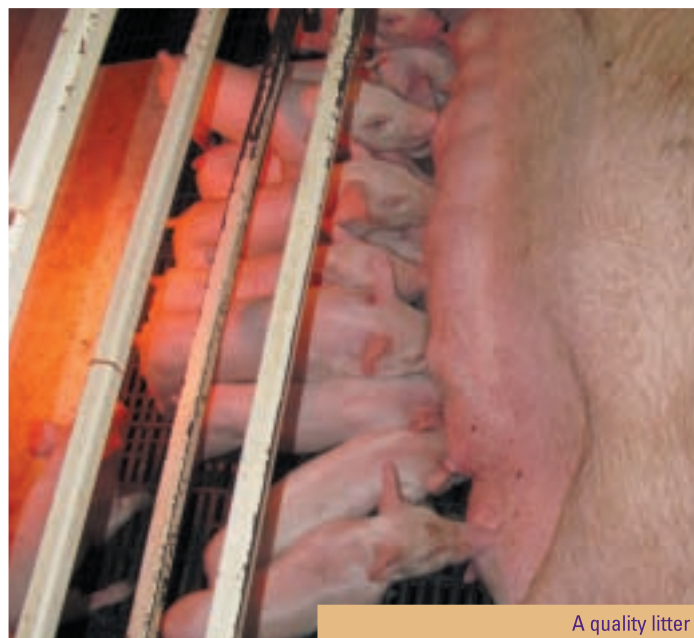
A quality litter

Joe and Amos are excited to see the high level of production in their new herd but are even more excited to see what level of production they will be able to achieve with a mature sow herd. They believe that 32+ pigs / sow / year is attainable in their herd. However, one thing they know for sure is that with TOPIGS it is going to get even better in the future.