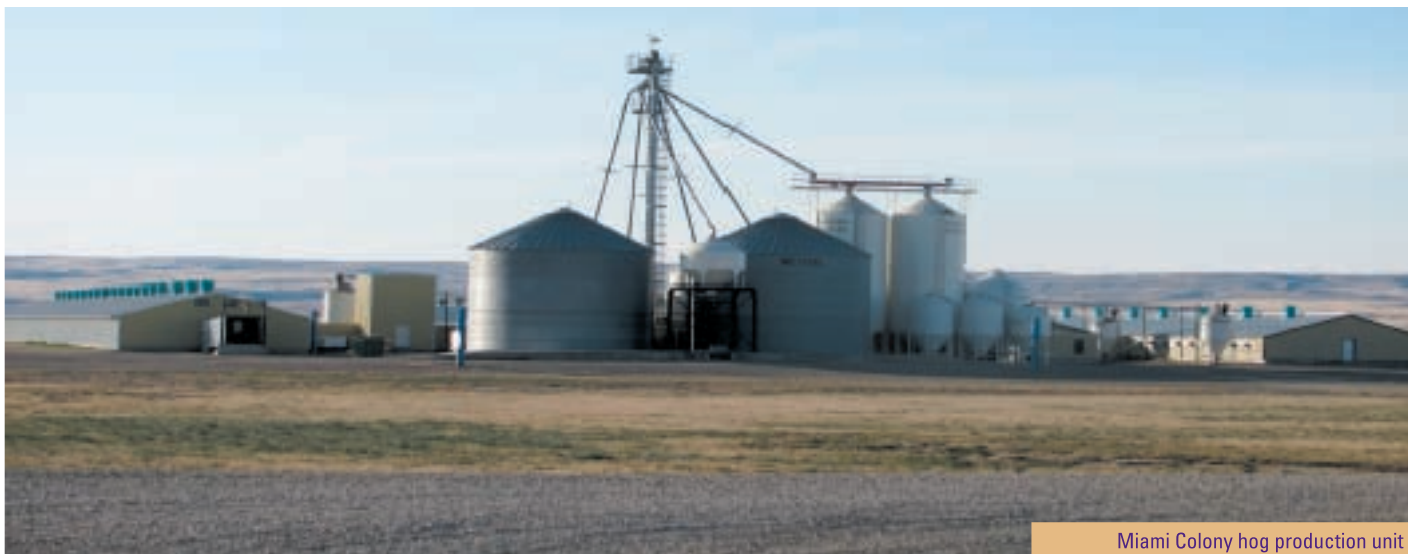
Miami Colony hog production unit

Miami Colony is located 25 minutes south of Lethbridge near the town of New Dayton, Alberta. The Hutterite Colony was established in 1924 and today is home for 75 colony members. They farm approximately 9,000 acres of mixed grains and oilseed crops. The land base is used to grow feed for their diversified livestock entities of 11,500 broiler chickens, a dairy herd of 80 cows, and their 280 sow farrow to finish unit. Joe Kleinsasser has been working in the hog unit for the last eight years and been managing the farms 280 sow unit for the past four and a half years. Along with farrowing barn manager, Amos Waldner, the two of them see to the day-to-day activities of the barn.