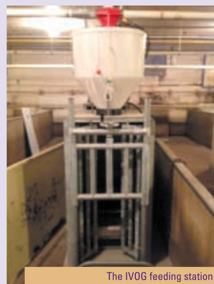
The IVOG feeding station

Terminal boars that have been tested and fed on the IVOG stations will be available for sale in early 2012.