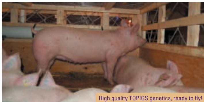
High quality TOPIGS genetics, ready to fly!