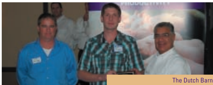
The Dutch Barn