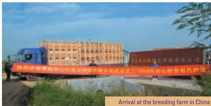
Arrival at the breeding farm in China

TOPIGS genetics are in high demand around the world due to the excellent health status of the Canadian TOPIGS herds, and many countries receive live breeding pigs from TOPIGS Canada. Exports to many countries including Russia, Chile, Mexico and Japan, to name only a few, are not out of the ordinary for TOPIGS. With smaller shipments of several hundred animals, the breeding pigs are usually trucked to an airport in the USA and then flown to their final destination.