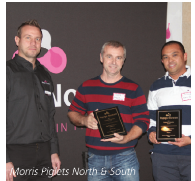
Morris Piglets North & South