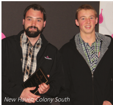
New Haven Colony South