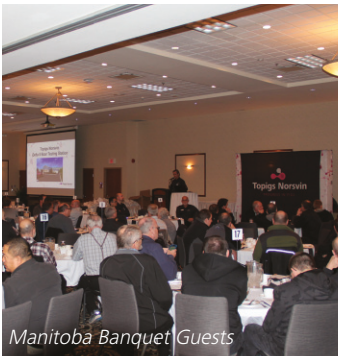
Manitoba Banquet Guests