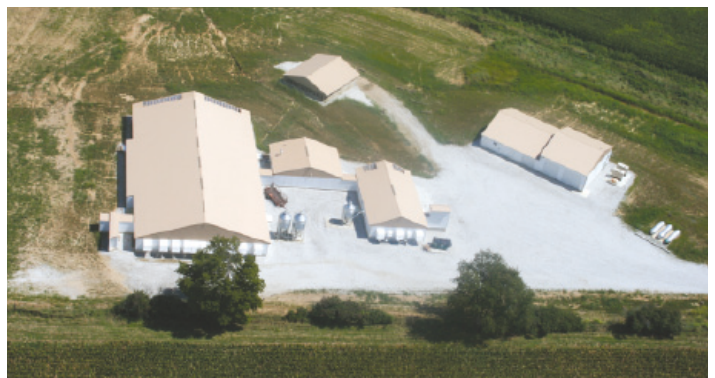
Grand Vertex, LLC